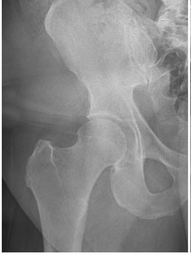
When articular cartilage is healthy, an x-ray will show space between the bones.