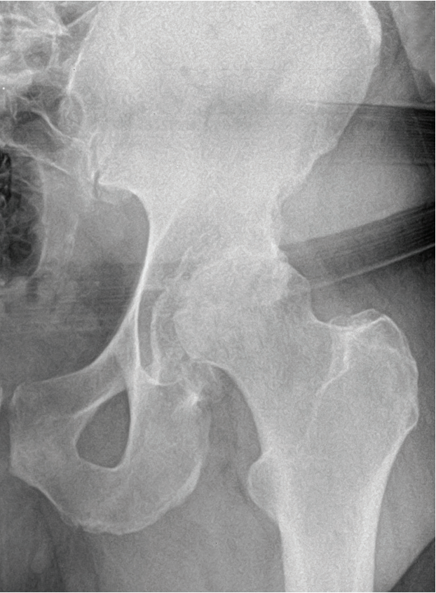
Arthritis is a term used to describe a condition where there is damage to the articular cartilage. When articular cartilage is damaged, an x-ray will show a loss of space between the bones.